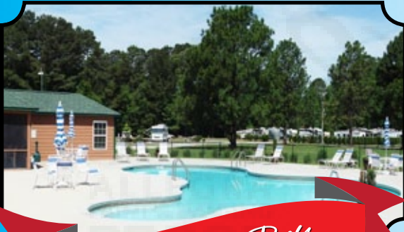
One of our Two Pools