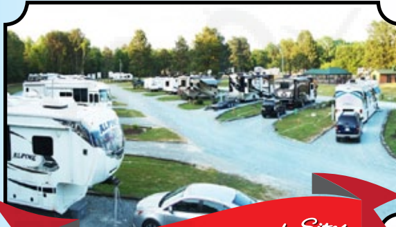
Huge Level Pull Through Sites

Ask about our special rates for Groups, Rallies, Reunions and Military Families!