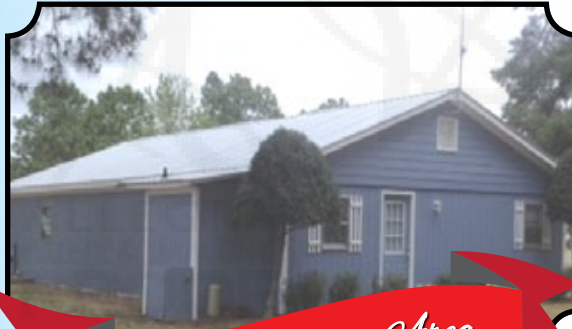
Clubhouse & Rally Area