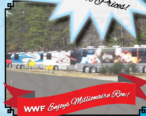
WWF Enjoys Millionaire Row!