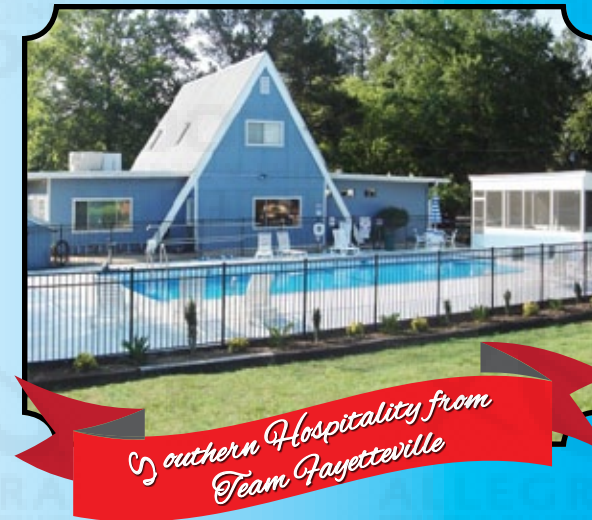
Southern Hospitality from Team Fayetteville

At Fayetteville RV Resort & Cottages, our team will escort you to your site to confirm everything is ship-shape. Whether you need help with our free cable or advice on wonderful day trips and antiquing, our welcoming team is committed to providing great service and warm, Southern hospitality. You may come as a stranger, but you will certainly leave as a friend and honored guest with our hopes you will return.